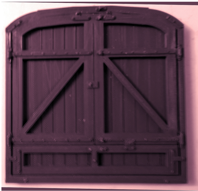
9ft American Bogie